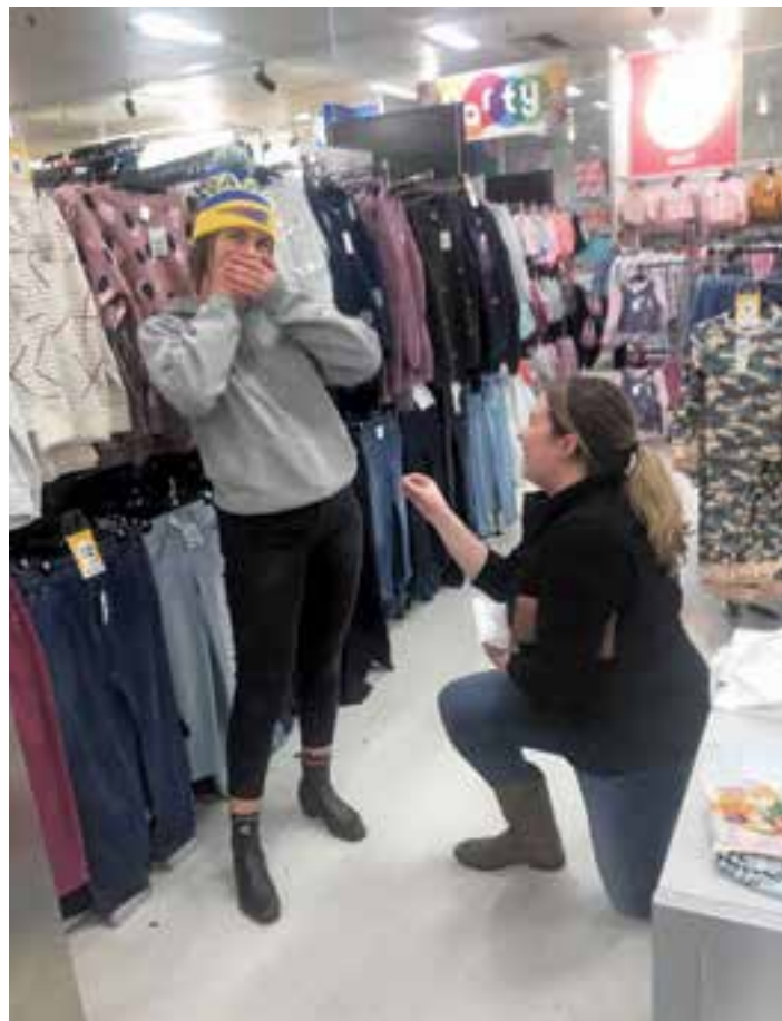
Picture from Hagley car rally - one of the tasks was to propose in a public area