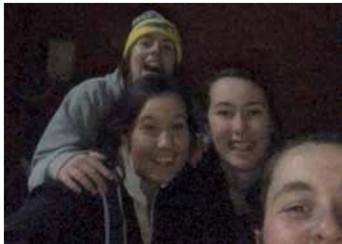
Picture from Hagley car rally - 'take a picture outside the Rural Youth Head Office'

With more dog jumps and truck shows coming up in the works as well, there is plenty happening here at Hagley Rural Youth.